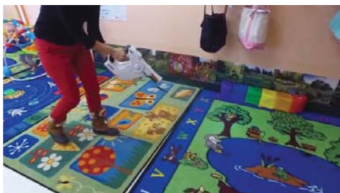
Carpets & Soft Surfaces