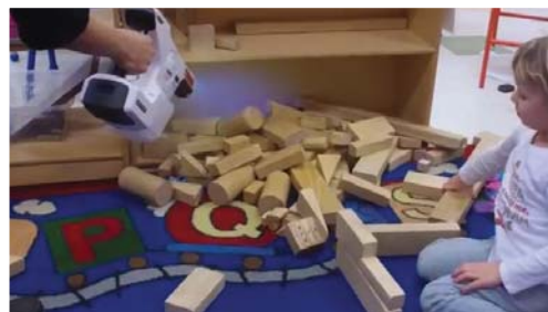
Blocks & Toys